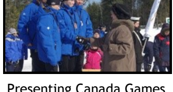
Presenting Canada Games medals for Cross Country Skiing at Martock (February 26, 2011)