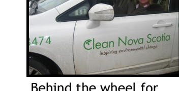
Behind the wheel for efficiency training with DrivewiseR (February 4, 2011)